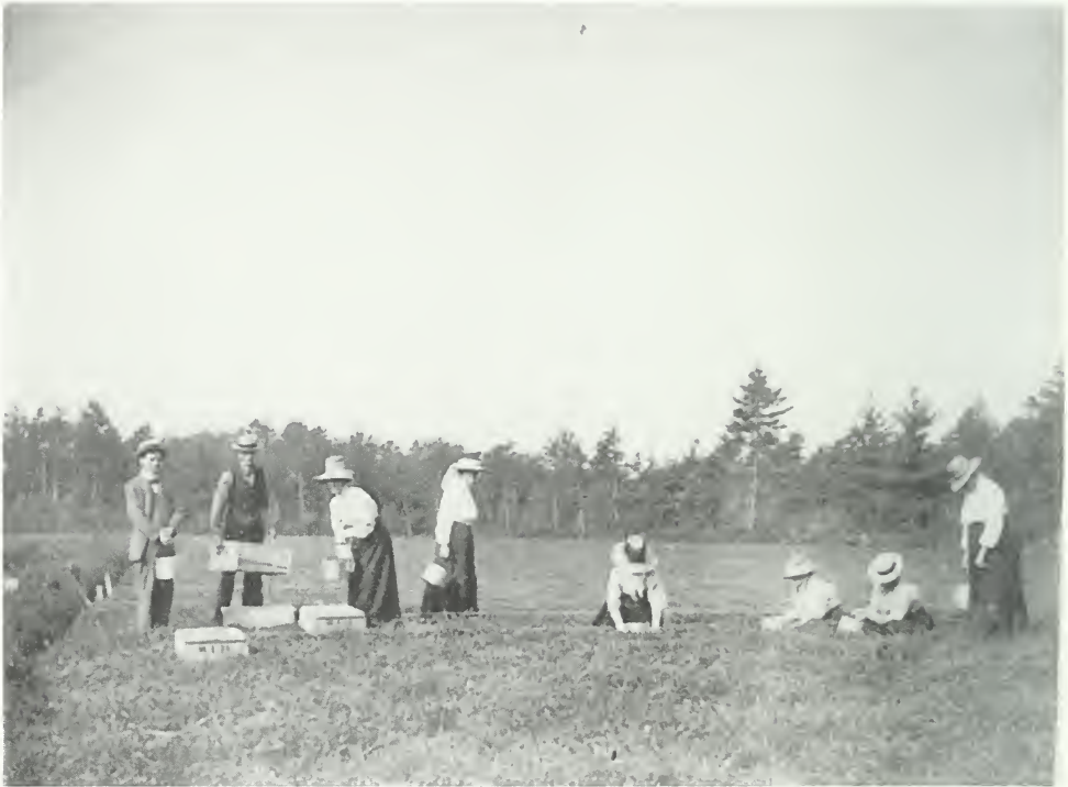
Cover photographs: Historical Cranberry Farming Scenes

Printed by: The Country Press Inc. www.countrypressinc.com