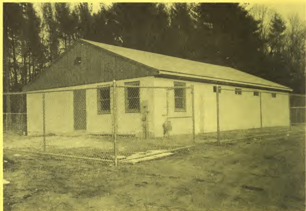
CARVER ANIMAL SHELTER