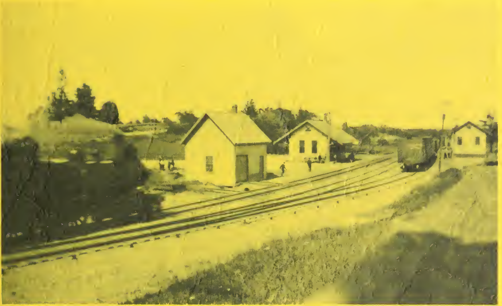
TRAIN APPROACHING NORTH CARVER STATION IN 1911