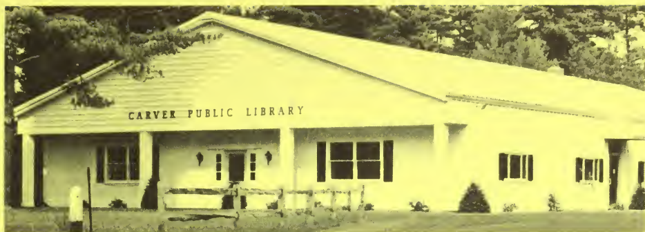
CARVER PUBLIC LIBRARY