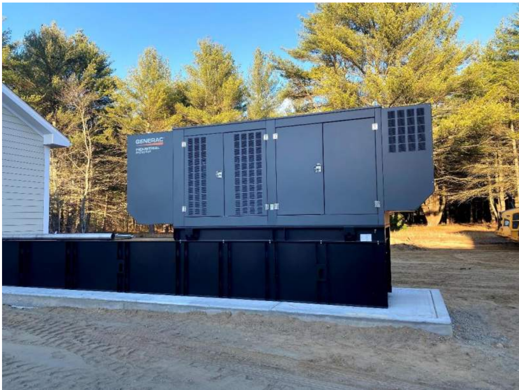
Generator Set on Concrete Pad