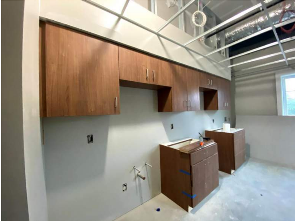
Millwork Installation Ongoing