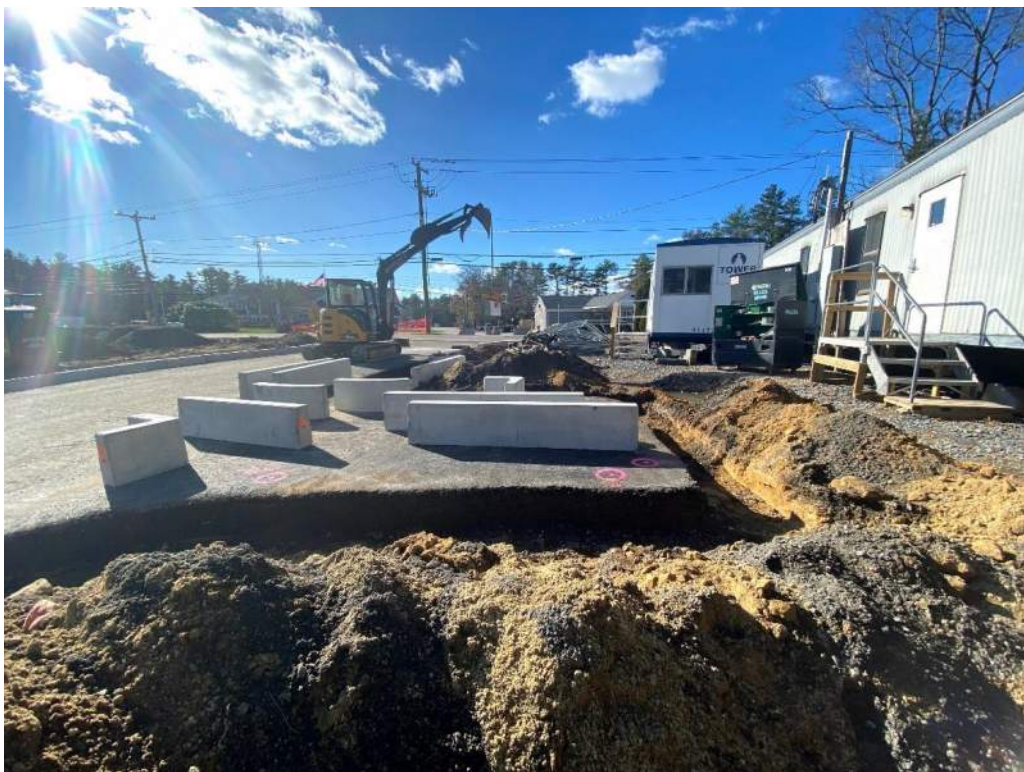
Pre-Cast Curbing Installation