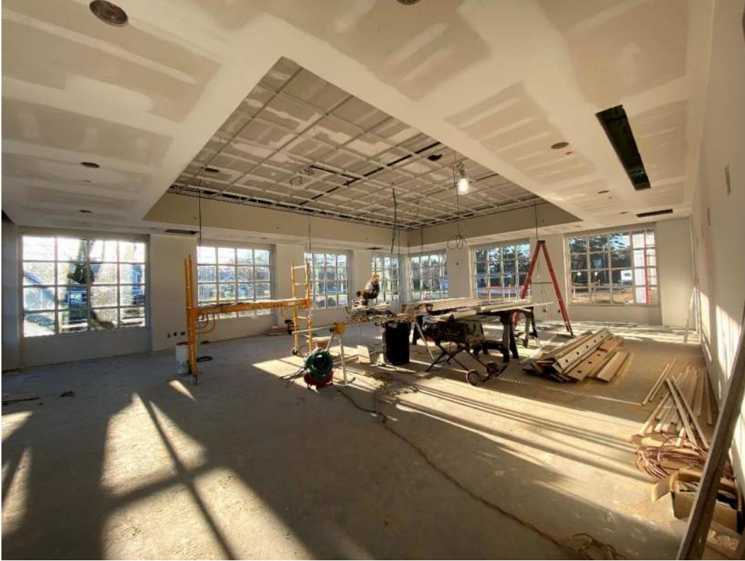
Training Room Progress