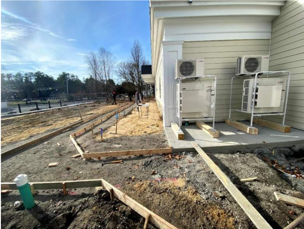
Condensing Units Set & Sidewalk Forms at South Exterior