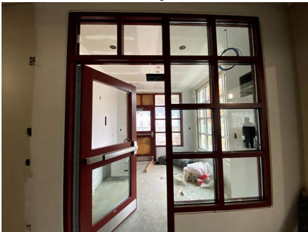
Aluminum Storefront Doors