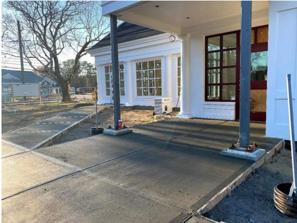
Main Entry Sidewalks Poured