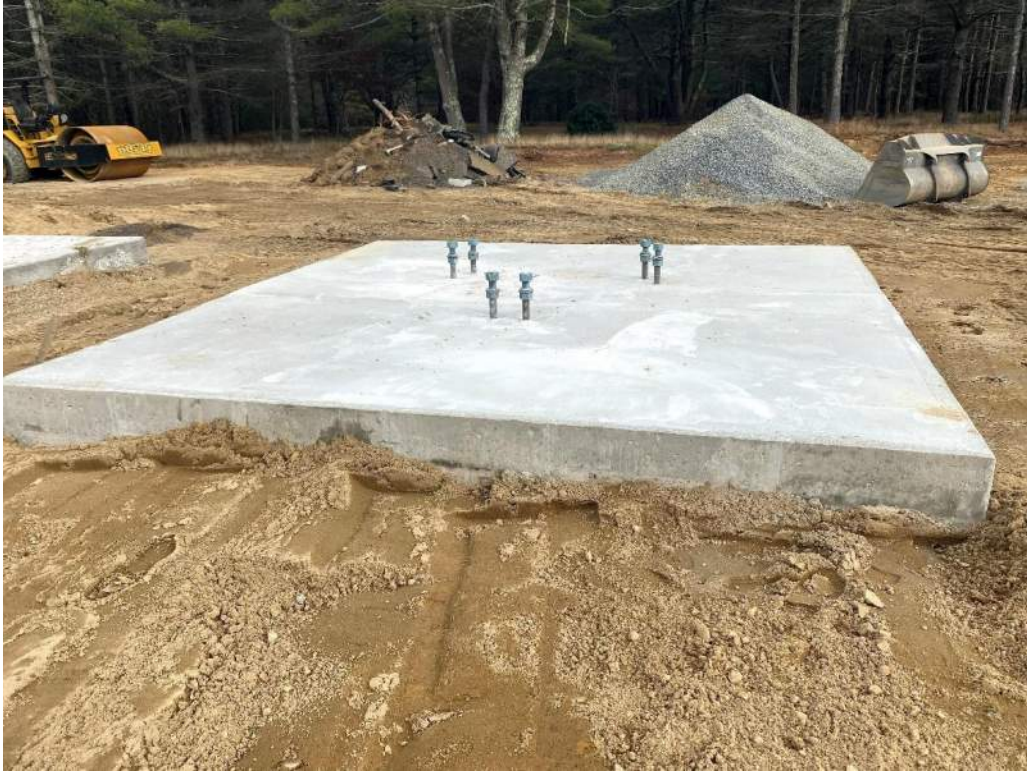
Radio Tower Pad Poured