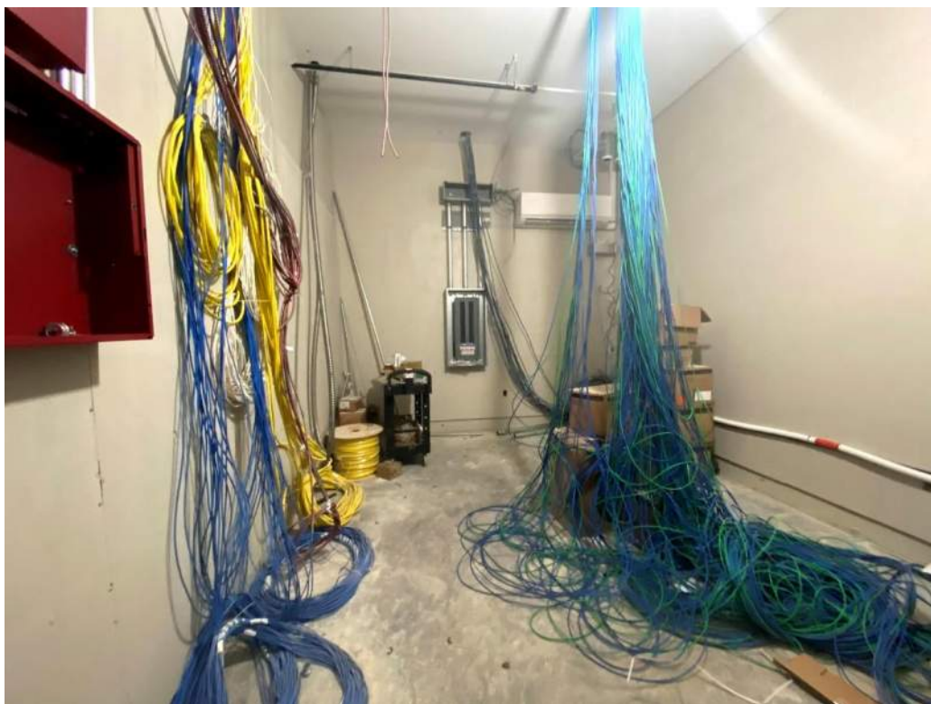
Communications Room Progress