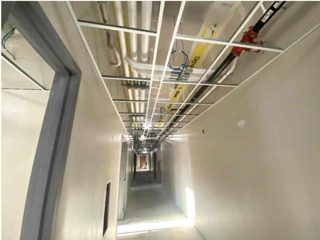
Overhead MEP Progress at Corridor