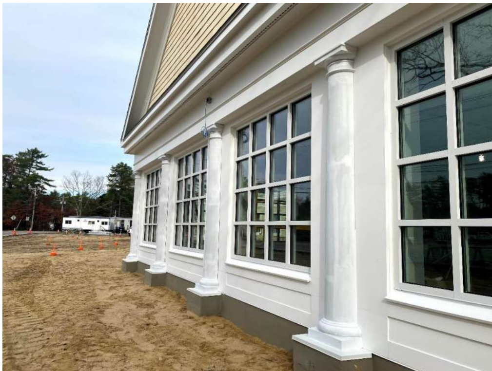
Fiberglass Columns Installed