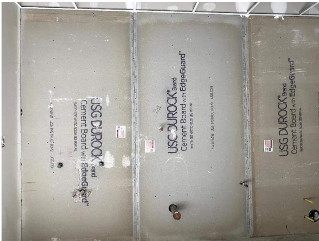
Durock Installed at Wet Walls