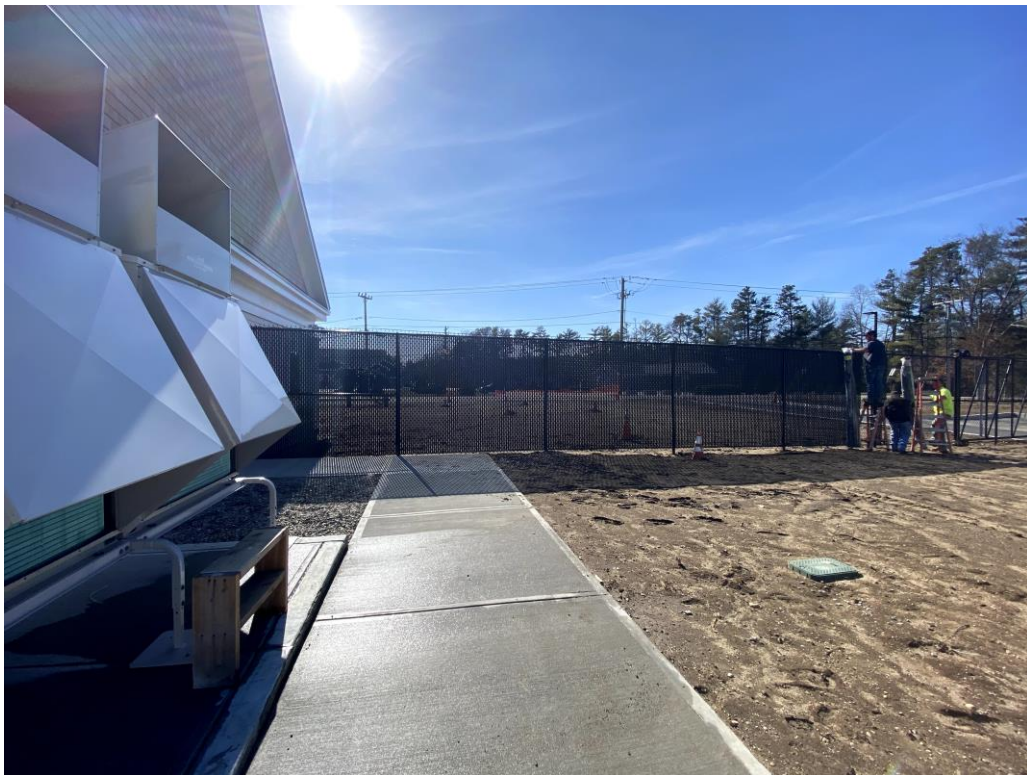
Privacy Screen on Fence Installed