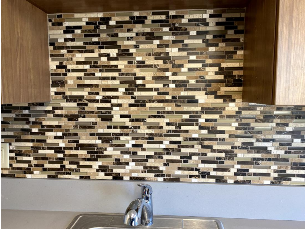
Backsplash Tile Completed in the Day Room