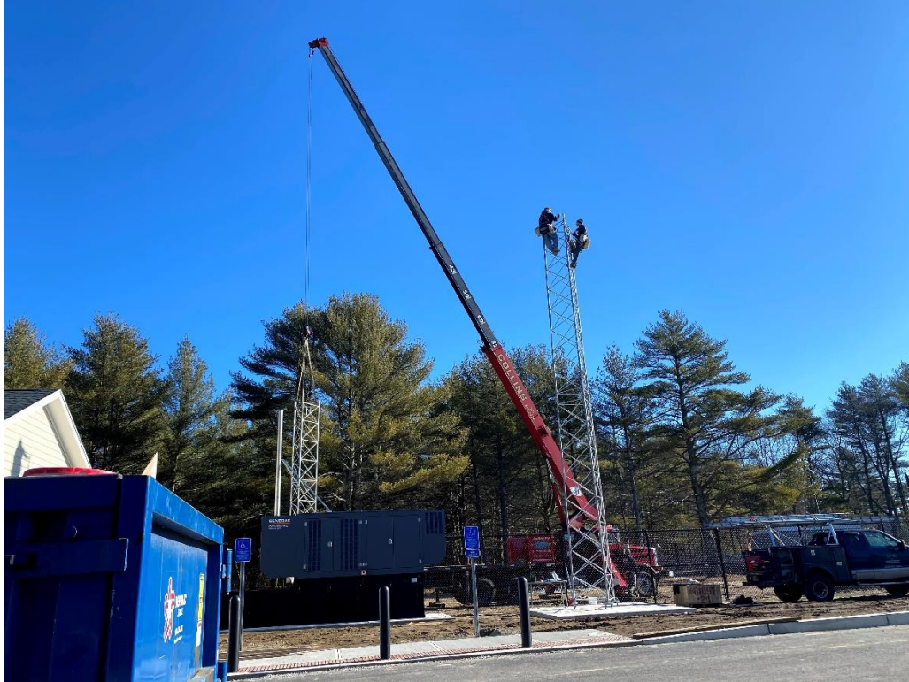
Radio Tower Installation