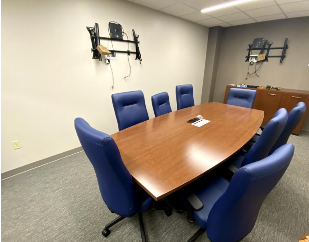
Conference Room Furniture Installed