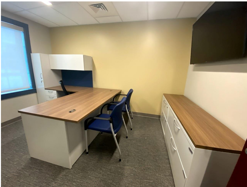
Office Furniture Installed