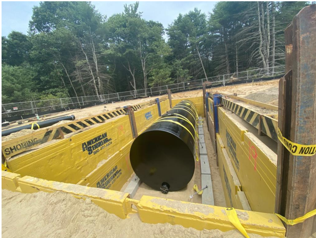
30,000 Gallon Cistern