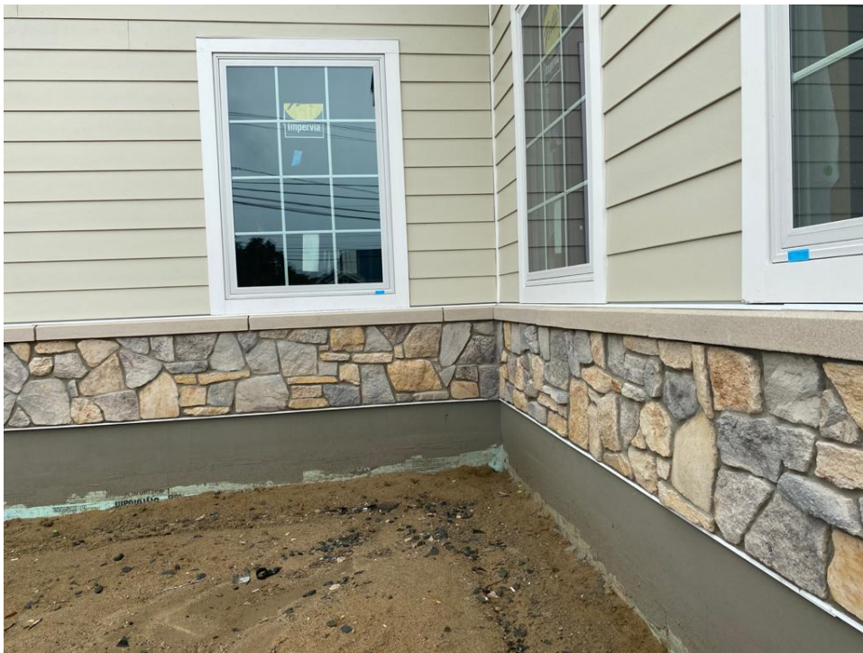
Cultured Stone Installation