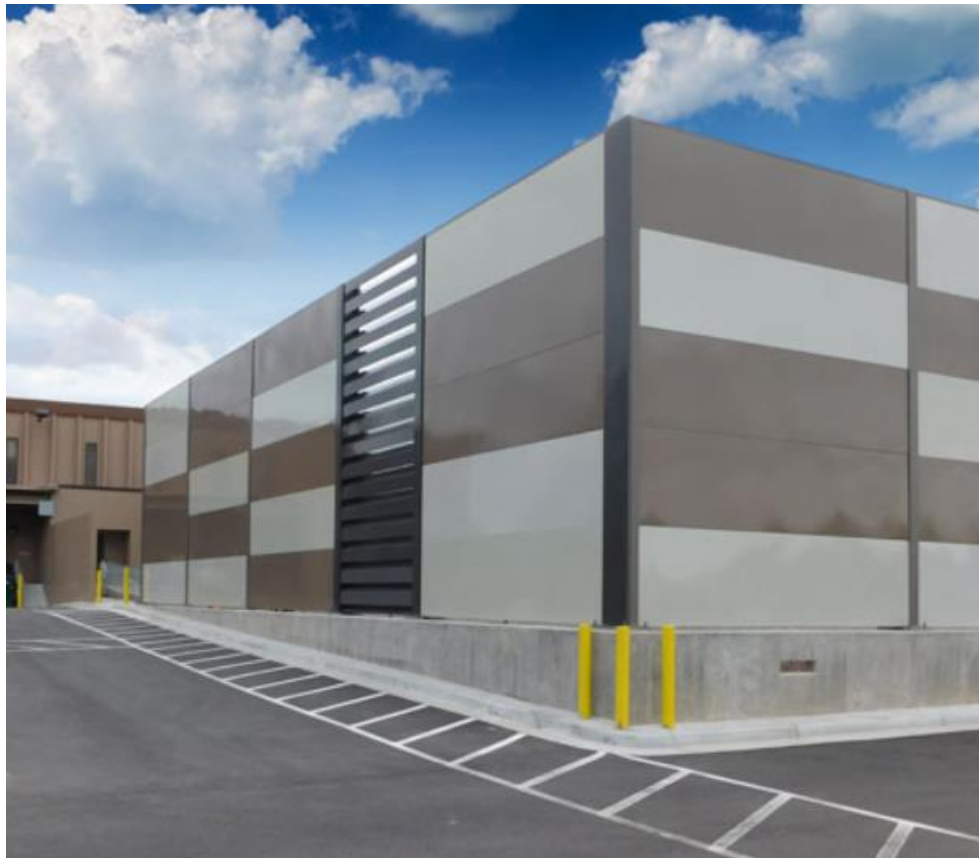
Figure 1: Example of Product Solution Noise Barrier 1